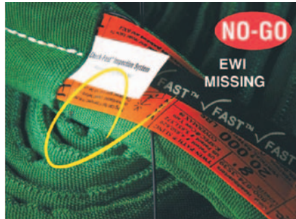
Fast® Inspection System, US Patent #7,661,737. Foreign Patents Pending

The next question is this: Is there a mechanical way to determine “hidden” UV damage in a roundsling? The answer is yes! On February 16, 2010 the United States issued a patent to Slingmax® Rigging Solutions (US #7,661,737) for a pre-failure warning indication system for all roundslings. It’s called the Check-Fast® inspection system. The following is a brief explanation of how it works.