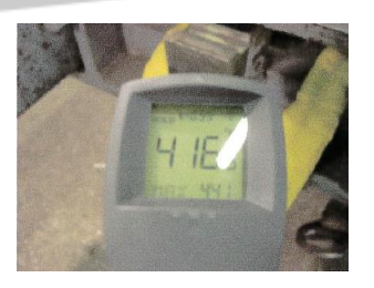
Figure 1- Heated Steel Block

Published: April 1991 Revised: March 2020