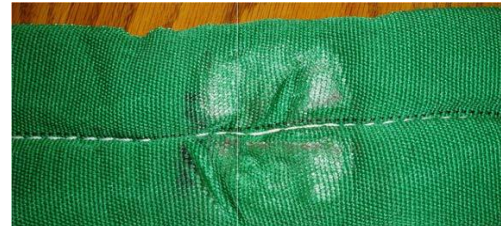
Figure 3- Loading Point After 50,000 Cycles

Testing was performed on a MTS 225 ton horizontal tensile test machine. During the cycling, temperature was measured by inserting a thermometer into the center crease of the sling as close to the loading surface as possible. After 50,000 cycles, the slings were inspected for damage, each showed some hardening and wear at the contact point as shown in Figure 3, but all remained intact.