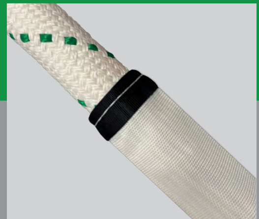
Helix™ is compatible with our Spider Sleeve Abrasion Protection