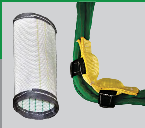
Helix™ is compatible with CornerMax® Pad & Sleeve Cut Protection