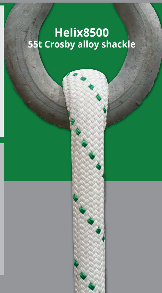
Helix8500 55t Crosby alloy shackle

Helix™ is equipped with an abrasion and chemical resistant HMPE braided jacket that protects the load bearing core yarn. This jacket is braided in the USA.