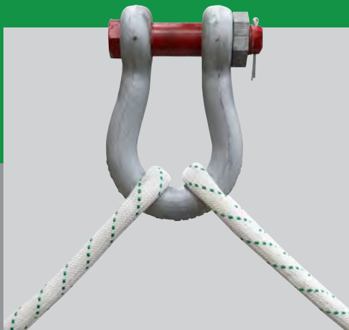
Helix8500 scale example in 85t Crosby shackle