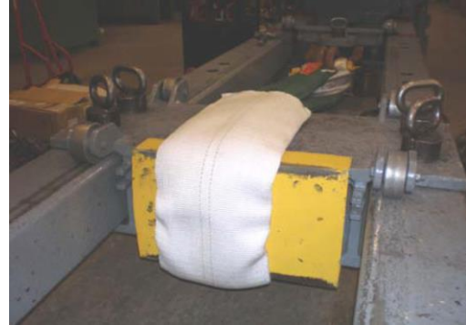
Figure 5 - Cut Testing

Cut protection materials were tested by installing over a Twin-Path TPXC 15000 sling and placed over the 90° edges of a sharpened steel edge in a basket configuration as shown in Figure 5. The 8 inch wide sling was then pulled to its basket capacity of 300,000 lbs. This exerted 37,500 lb of force per inch of sling width. When the sample was unloaded and removed from the tensile tester, there was no damage to either the Twin-Path sling or the CornerMax sleeve. Figure 6 shows the samples after they have been tested.