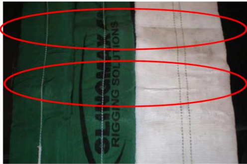
Figure 6 - Sling and Sleeve Post-Test

Additional testing was performed in the same arrangement, this time taking the sling to destruction. The slings were tested with the CornerMax® Pads and Sleeves as well as nylon webbing and a light duty HMPE sleeve. The level of protection provided by each type of cut protection is summarized in Figure 7.