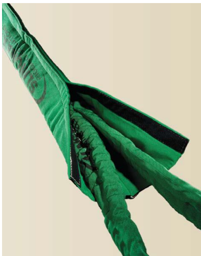
Figure 2 - Synthetic Armor™ Pad Abrasion Protection

In the case of applications where the built-in protection is not sufficient, additional abrasion protection can be added. Figure 2 is an example of abrasion protection consisting of the same material as the sling cover in a sliding pad that can be moved to the area of abrasion. Pads can also be constructed to be removable so that the life of the sling can be extended by replacing the abrasion pad periodically.