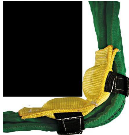
Figure 3 - CornerMax® Pad

The CornerMax® pad shown in Figure 3 works by physically separating the sling from making contact with the edge of the load. The pad creates a “tunnel” of cut protection and the edge does not come into contact with the pad or the sling. Note that the sides of the pads must be completely supported in order to create and maintain the “tunnel”. This principal has been used for years when riggers would place wooden 2”x4” boards on either side of an edge to separate the sling from making contact. While this method was effective, the boards are only held in place by the loading of the sling. They must be held in place by hand until there is enough load on the sling to keep them stationary, and once the sling is unloaded they can fall, causing injury or damage. The CornerMax® pad can be securely attached to the sling in the position needed, and easily removed when the job is complete.