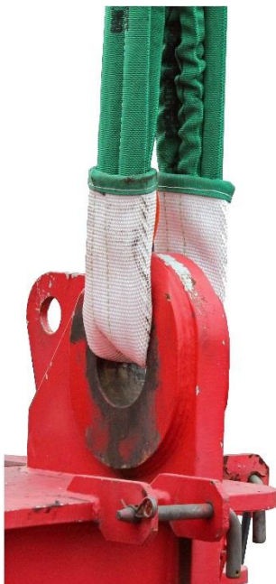
Figure 4 - CornerMax® Sleeve

CornerMax® pads are designed to protect from 90° straight edges. CornerMax® sleeves are used when edges are curved, rough, or irregular. Figure 4 shows an application where pads, blocks or other traditional cut protections would not fit, so a sleeve material must be used to protect the sling from the edges of the hole. In order for a cut protection material to provide sufficient protection for the sling, it must be tested to withstand the cutting forces that could be generated by the sling in use. In the case of the CornerMax® sleeve material, it is constructed with Dyneema® high modulus polyethylene (HMPE) fiber that is specially woven to withstand the high cutting forces encountered between a sling and a sharp edge. In order to determine the level of cut protection provided, CornerMax® sleeves and pads were tested in comparison with other materials commonly used for sling cut protection.