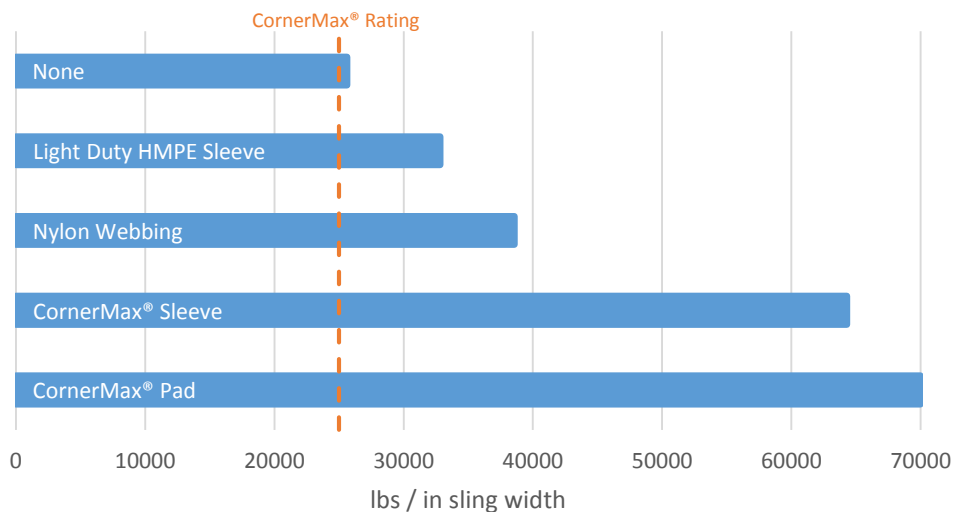
Figure 7 - Cut Protection Results

Additional testing was performed in the same arrangement, this time taking the sling to destruction. The slings were tested with the CornerMax® Pads and Sleeves as well as nylon webbing and a light duty HMPE sleeve. The level of protection provided by each type of cut protection is summarized in Figure 7.