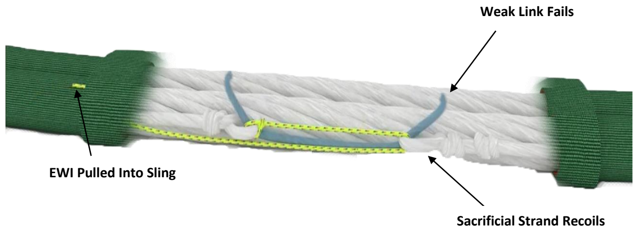
Figure 2 – Check-Fast During Overload