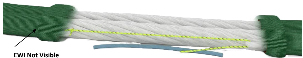
Figure 3 - Check-Fast After Overload