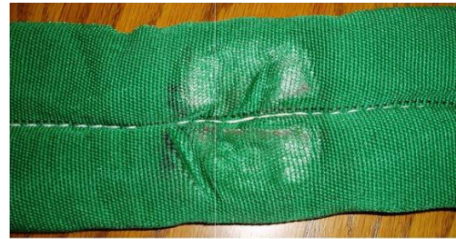
Figure 1 - Loading Point after 50,000 Cycles

In 2006, three Twin-Path slings were subjected to cyclic tension-tension loading in a laboratory setting. In this test, three slings with a working load limit of 25,000 lb were cycled from 550 – 37,500 lbf for 50,000 cycles. Each cycle was from 2 – 150% of working load limit, this is an extremely wide range compared to real world use and serves to accelerate the damage so that testing could be completed in a reasonable time frame. In this test, all three slings survived the 50,000 cycles, and one was pulled to failure after. Figure 1 shows the loading point with minimal damage after the cycling was complete. The sling pulled to failure still had 84% of its original rated breaking strength. For full details of this test, see Slingmax Technical Bulletin 9a.