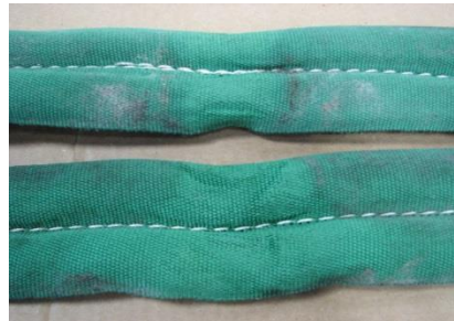
Figure 4 - Used Sling after Cleaning