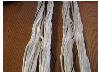
Figure 5 - K-Spec® Core Yarn from Used Sling