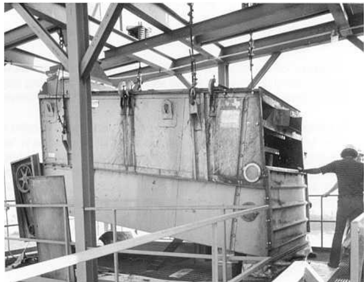
Figure 2 - Texas Shaker Vibrating Screen

The Texas-Shaker shown in Figure 2 is a vibrating screen that sorts dry granular material by size by vibrating a feed of material through a series of different size screens. In order to reduce vibration that is transmitted to any surrounding structure, it is suspended from four steel wire rope cables. The steel wire ropes were experiencing failures after less than 11 months in use. A Twin-Path sling was installed along with three of the original steel wire ropes. After 16 months of continuous use in a dusty outdoor environment, the Twin-Path sling was taken out of service for inspection.