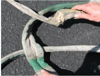
Figure 3 - Sling after 16 Months of Use

The entire sling was covered in dust except for the bearing point. After the sling was cleaned it was found that there was no visible damage to the jacket or the K-Spec® strength member yarn inside. The sling was then load tested to determine residual breaking strength. The sling had a vertical working load limit of 15,000 lb with a 5:1 design factor, which means a minimum breaking strength of 75,000 lb. When the sling was broken, it achieved 98,319 lbf, or 30% above the minimum required for the wire rope originally used. For a full report and video of the application, see Slingmax Technical Bulletin 42.